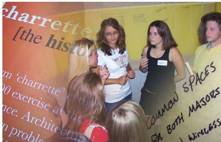
Design charrettes provided Interior Design and Graphic & Communication Design students the chance to have input into their new surroundings.

"We have known from the start that new or upgraded facilities would be needed for programs currently housed on the West Campus, but those needs existed regardless of the disposition of the property," she said. To help ensure that all of the College's facilities needs were addressed, the Board of Trustees contracted with DRS Architects to prepare a new Facilities Master Plan. The plan was created to address both the long-term facilities needs of the College, as well as temporary space needs during the transition to the East Campus.